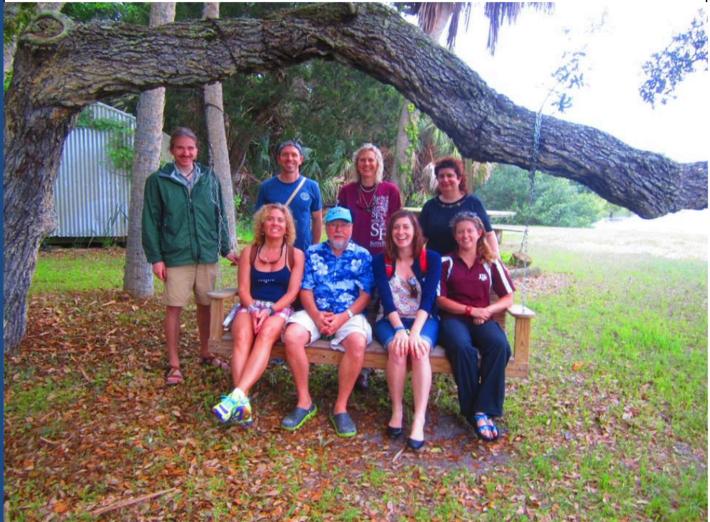
Image from 2014 AAG Meeting fieldtrip to the Santa Fe College Resources Lab at Seahorse Key, Florida.