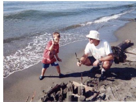
Early experiments in beach morphology.